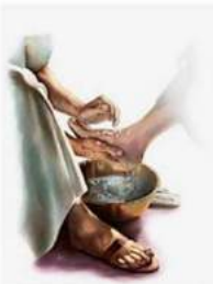
"You should wash each other's feet" (John 13:14).